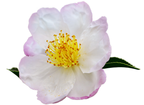
Camellia Sasanqua 'Narumigata'

A club for people who enjoy their gardens and share a par- ticular interest in camellias.