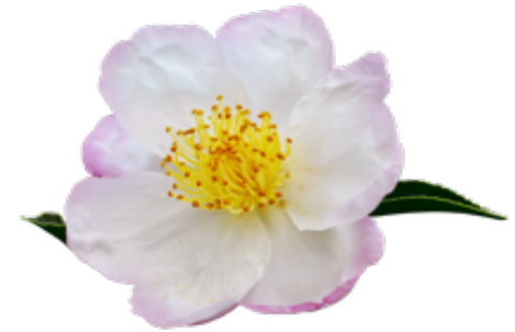
Camellia Sasanqua 'Narumigata'